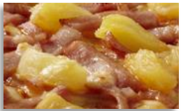
Hawaiian Pizza Champagne, late-Harvest pineapple and mozzarella