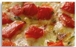
Margarita Pizza Diced tomato, mozzarella and oregano