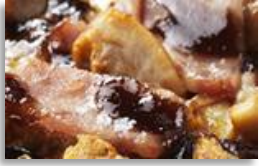
BBQ Chicken and Bacon Pizza Chicken, Shredded bacon rasher, and onion on BBQ sauce