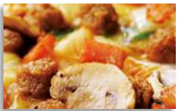
Supreme Pizza Pepperoni, rasher bacon, capsicum, ground beef, Italian sausage, mushroom, pineapple and oregano