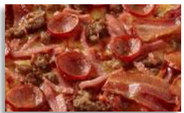
Meatlover's Pizza Pepperoni, rasher bacon, champagne ham, beef, Italian sausage on BBQ sauce